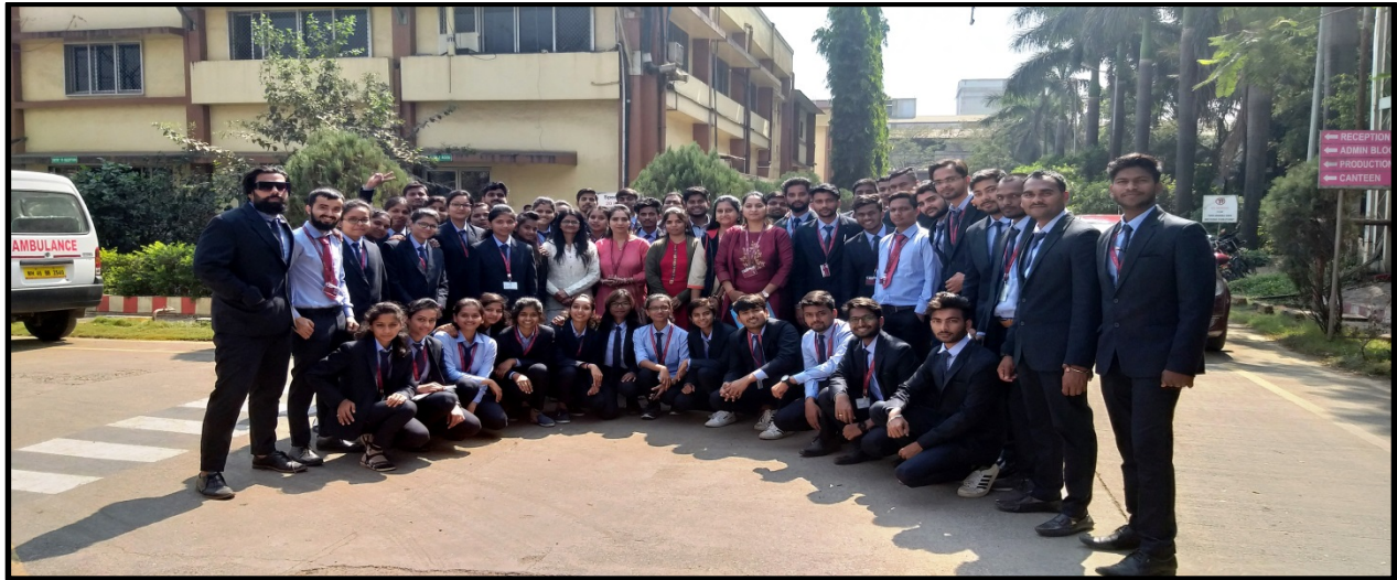
Local Industrial visit @ PARLE PVT.LTD,Khopoli